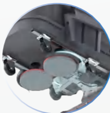
Double 13inch brushes