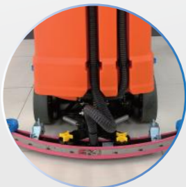
Simple design of SS steel squeegee kit