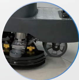
Double 16inch brushes rear drive system