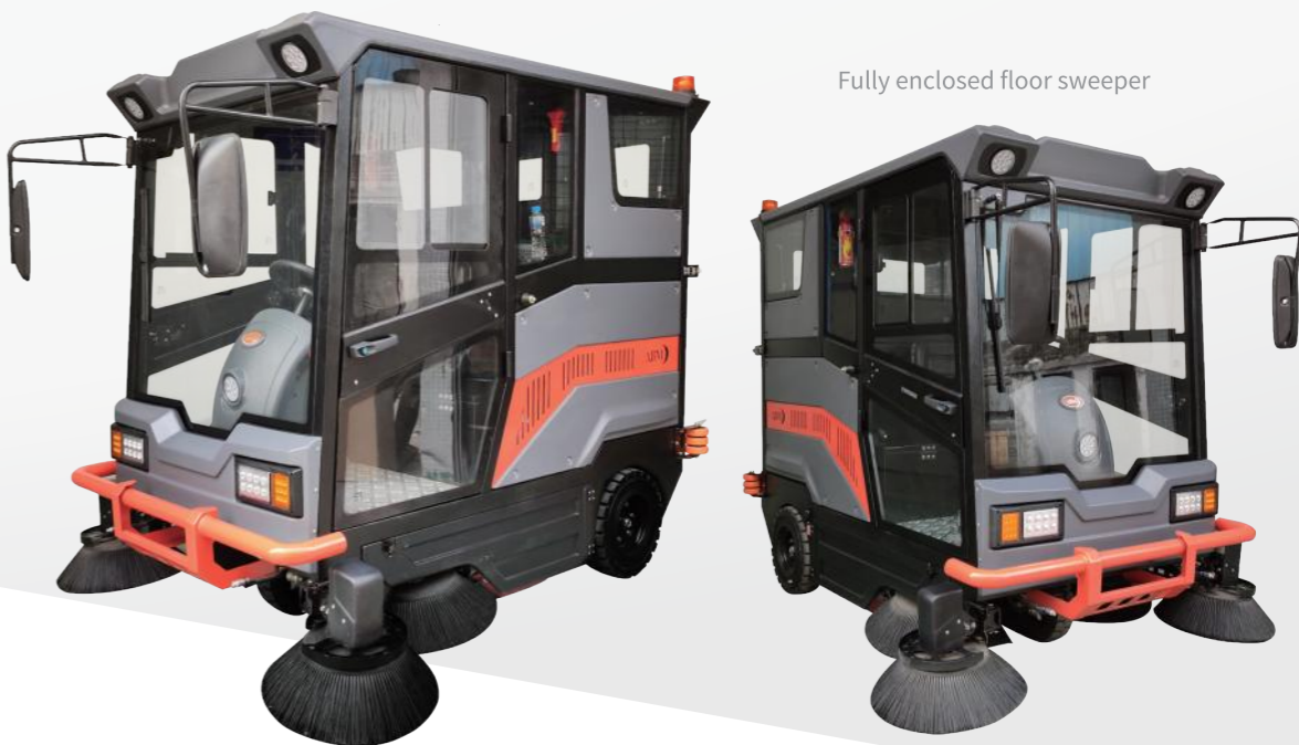
Fully enclosed floor sweeper

Mainly used for cleaning epoxy resin floors, cement floors, marble floors, polished tile floors, concrete floors, terrazzo floors, etc.