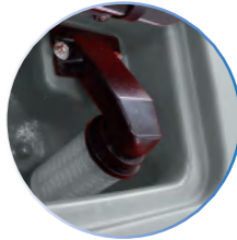
Plastic float cage/SS Steel optional