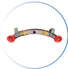
Simple design of SS steel squeegee kit with level