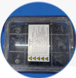
Visible sewage tank