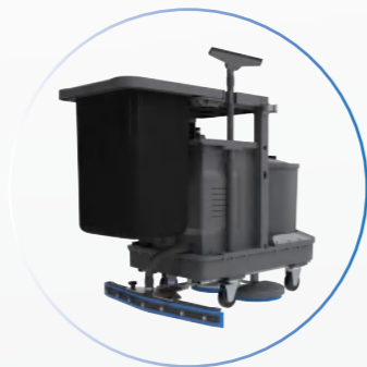
Equip cleaning bag, different clean tools