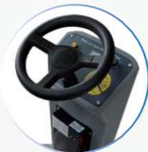
Intelligent operating system