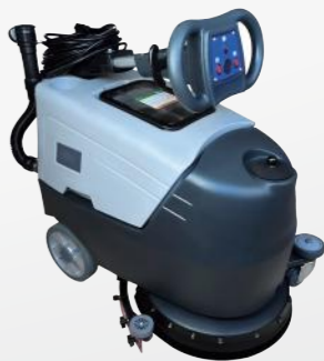
Battery/Cable version optional