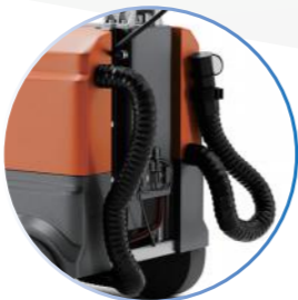
Battery and charger equipped with machine