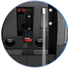
Visual water level tube