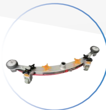
Tool-free adjustment, anti-rust and anti-corrosion aluminum squeegee kit with level